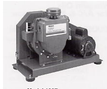
Model 1397 Displacement 17.76 CFM Ultimate Pressure .0001 Torr

SHIPS NEXT BUSINESS DAY when ordered by 12:00 PM