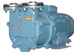
CLOSE-COUPLED VACUUM PUMP FOR SPACE SAVINGS